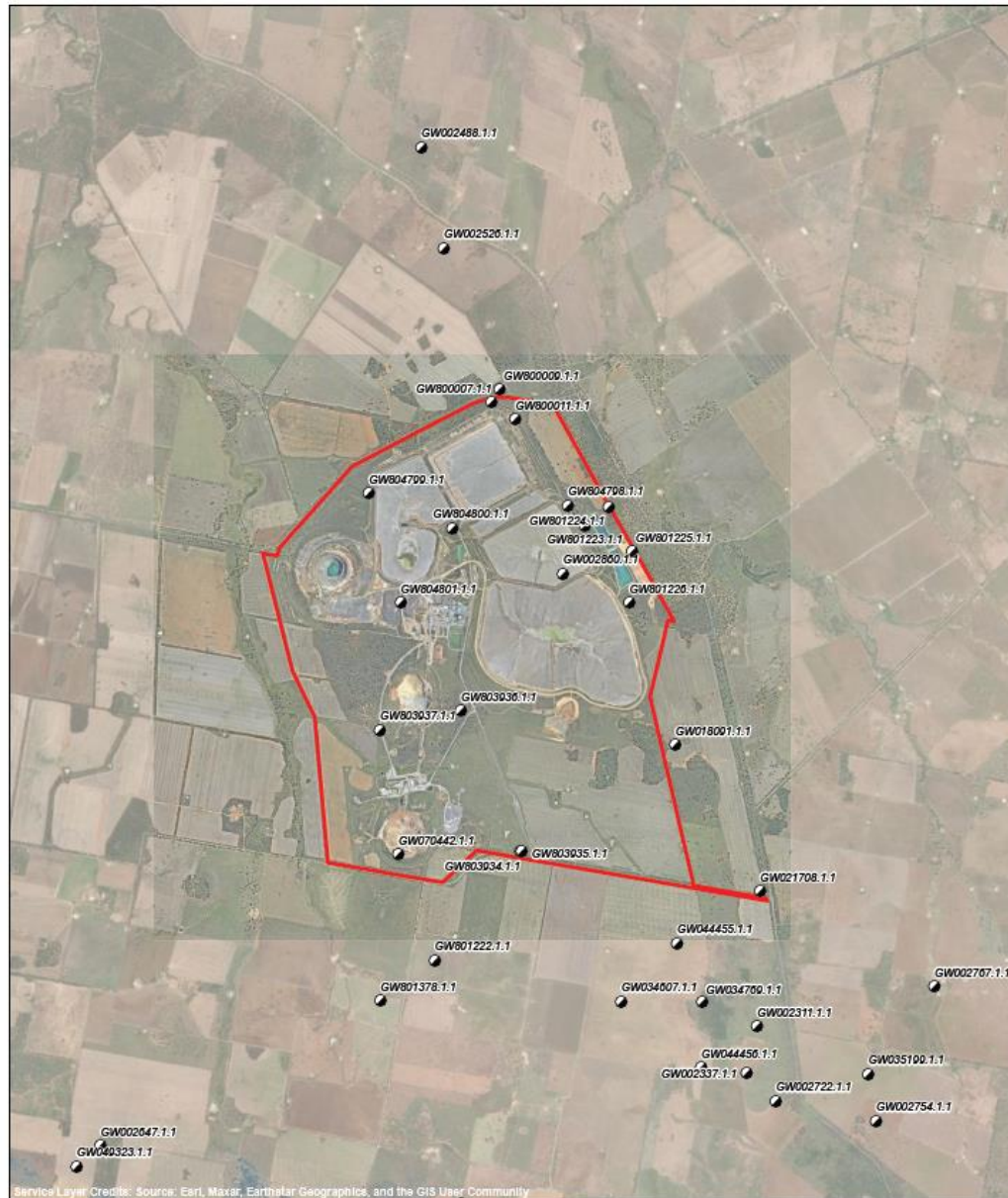
Figure 2 Registered groundwater bores

LEGEND Project approval area Registered groundwater bores