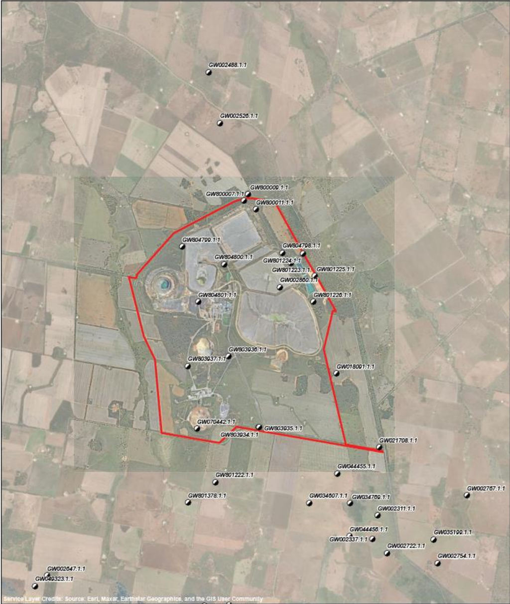
Figure 2 Registered groundwater bores

LEGEND Project approval area Registered groundwater bores