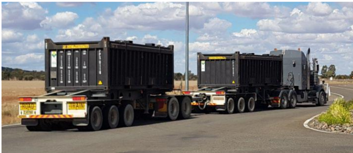
Figure 2 A-Double Configuration

These vehicles, a picture of which is provided by Figure 2 , are 28.4 m in length and operate with 11 axles. The arrangement is only slightly longer than a B-Double arrangement (26 m) and much shorter than a traditional A-Double arrangement (36.5 m).