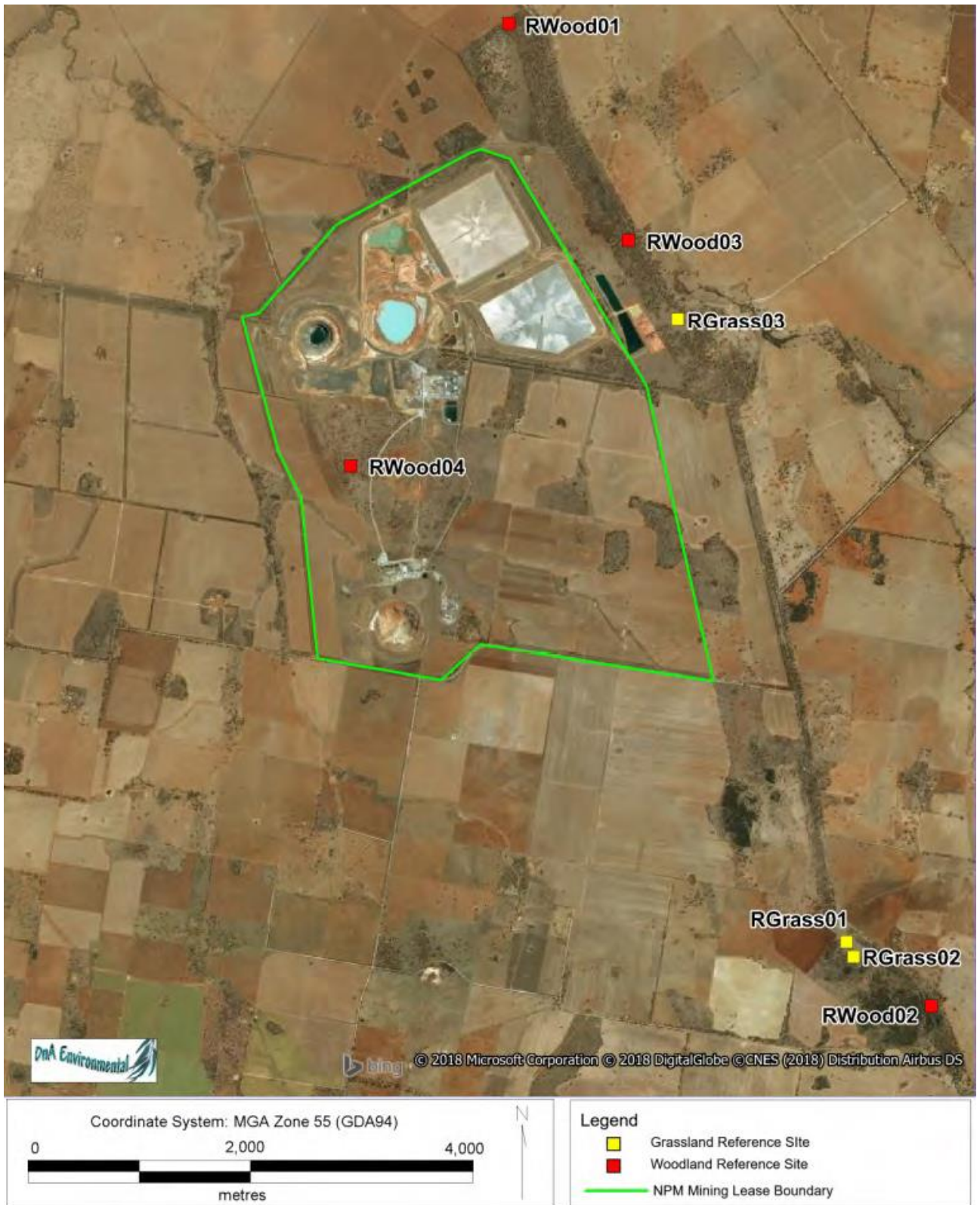
Figure 2: Rehabilitation Monitoring Location for Estcourt Offset area