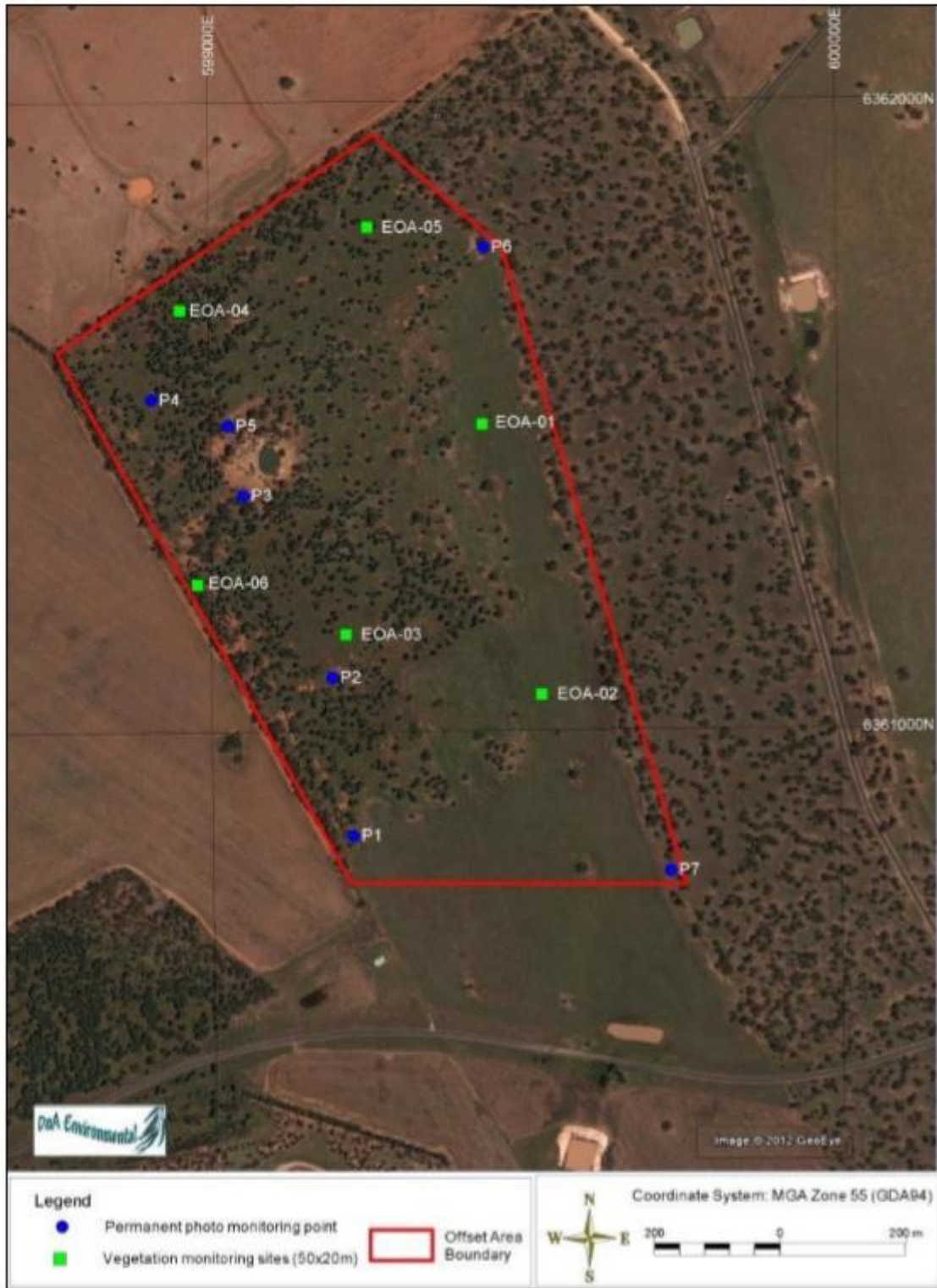
Figure 3: Rehabilitation Monitoring Sites for Estcourt Offset Area